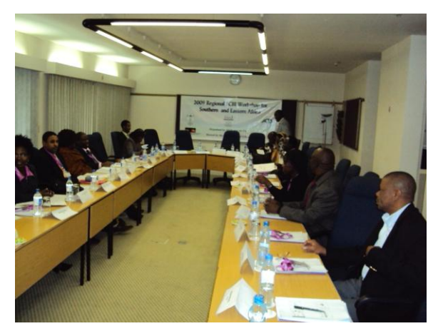
Suggested immediate steps after the ecbi regional workshop;